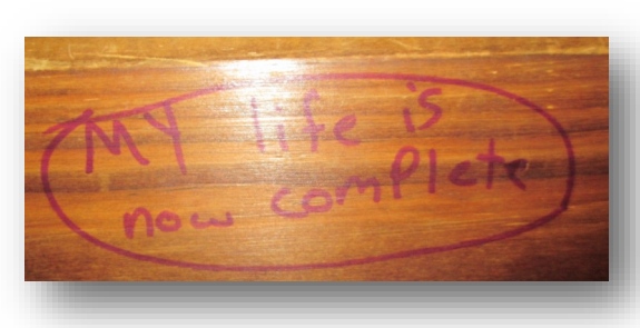
What more can I say?...

There is a message from one of the students that I found in my room: